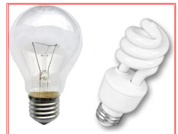
Light Bulbs Incandescent Vs Fluorescent

This is the last Sinewaves before the Dayton Hamfest so if you are going you should be making plans now. Dayton Hamfest runs from May 17, 2013 through May 19, 2013. The location is Hara Arena 1001 Shiloh Sprints Road, Trotwood, OH. For more information go to http://hamvention.org The Hamfest is sponsored by Dayton Amateur Radio Association (DARA). Talk in repeaters will be 146.940 MHz 123.0Hz and 442.100 PL 88.5Hz MHz. If you are still using snail mail then you can write to DARA, W8BI Box 694 Dayton, OH 45401. To all that are attend the Dayton Hamfest, drive carefully and have a great time.