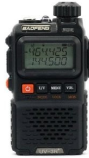
UV-5R VHF/UHF 2mtrs/70cms