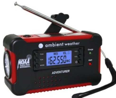
WR-111B Emergency Ambient Weather Radio w/hand crank

These 3 items will be raffled from now to Field Day. The drawing will be on the evening of Saturday during the evening meal. The item at the top is for licensed Amateur Radio Operators, but can be used on FRS and GRS frequencies. The Solar battery charger can be used to charge cell phones and other electronic devices. The WR-111B can be used to listen to NOAA weather/Commercial Radio and is a crank charger to be used with a power failure. Chances are $2,00 each or three for $5.00. Tickets will be available at the May 16 th meeting and the June 20 th meeting. Also you may contact Dick K8TPH at k8dfsjara@aol.com or by phone at 304 629 4302