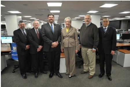
NN4INK only man with out a tie

what the hams did was stop runners from continuing the run and then they also used their net to notify the location and names of the runners located. at each shelter. Most of the shelters were out of the cell phone blackout so they also loaned cell phones to the runners to contact love ones to assure them that they were safe. My hat goes off to anyone that can muster that many hams and control a net work without major difficulties.