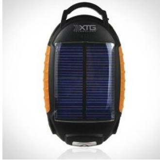
SOLAR POWERED BATTERY PACK. Used for charging Cell phones and other hand held devises